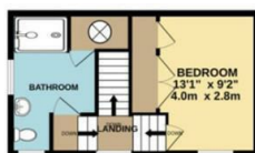
COTTAGE 1ST FLOOR 300 sq ft. (27.9 sq.m.) approx.