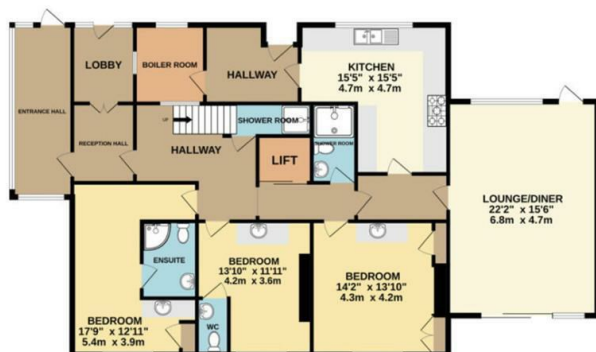
GROUND FLOOR 1781 sq ft. (163.8 sq.m.) approx.